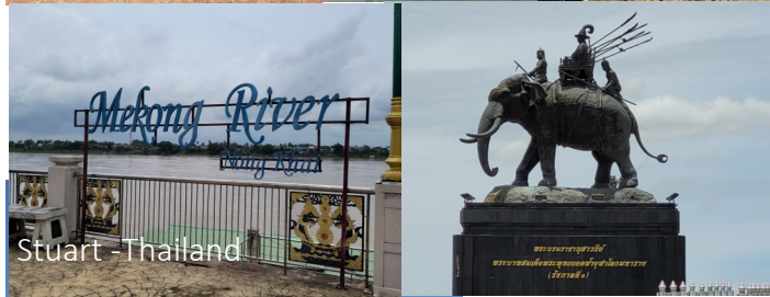
Stuart - Thailand