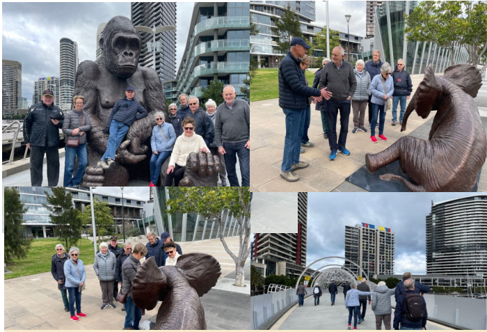
Walking for Enjoyment - Baby Elephant Walk, August